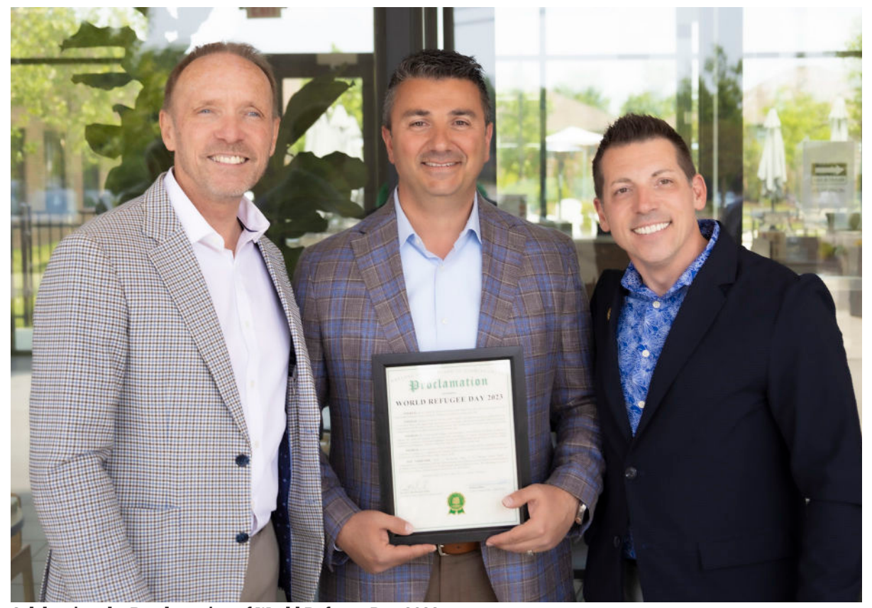
Celebrating the Proclamation of World Refugee Day 2023.

At CCF, we engage in conversations with those that create policy and laws, making sure even the smallest voices are heard, holding leaders accountable for the greater common good of all. In 2023 the Chaldean Community Foundation assisted over 2,000 individuals with advocacy services ranging from eviction to employee stereotyping and religious discrimination.