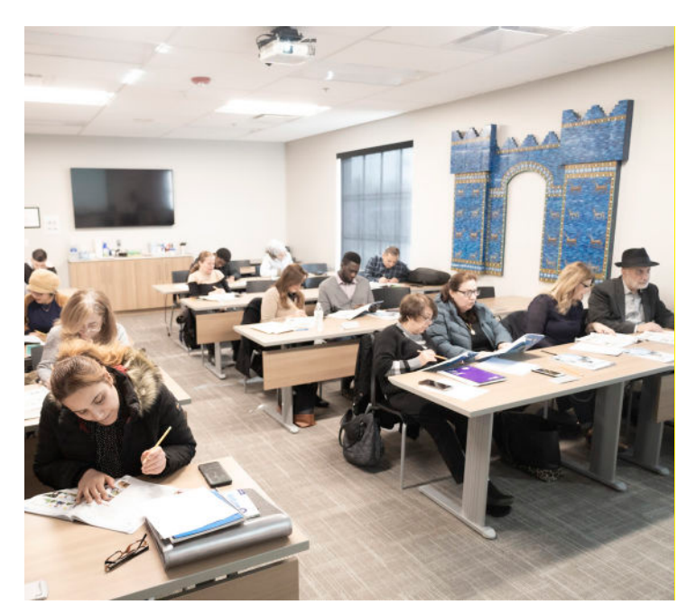
CCF offers four levels of study for adult ESL students.

As part of acculturation, CCF has offered a multitude of classes taking each client in need along the correct path to their success. Having the equivalency of a high school diploma can lead to further education and higher paying job opportunities for clients, changing their lives and leading families to financial stability.