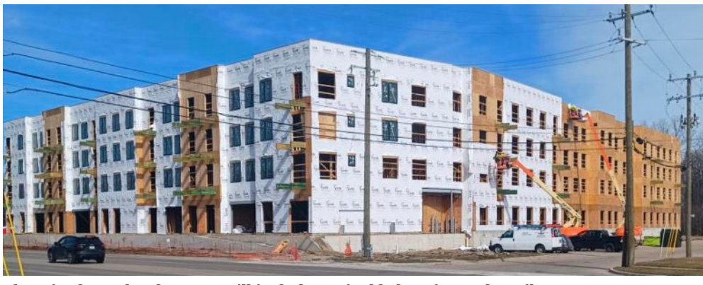
The mixed-use development will include attainable housing and retail space.

The Chaldean Community Foundation is building a 135-unit mixed income and mixed-use development at 43700 Van Dyke Road in Sterling Heights. Located in an Opportunity Zone, the new construction 4-story building will eliminate blighted commercial property along Van Dyke Road and replace it with a development that features 135 affordable apartments and 9,000 square feet of commercial space on the ground floor that will employ several special needs adults. The total square footage of the building is planned to be 133,000 square feet, with 153 surface parking spaces located in a central courtyard. The vision is to develop the front 3 acres and establish a wetland area with access