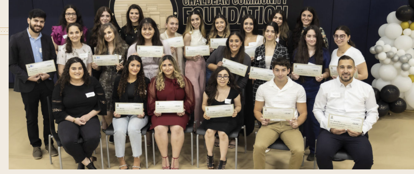
The CCF awarded a total of $103,000 to 33 scholarship recipients in 2023.