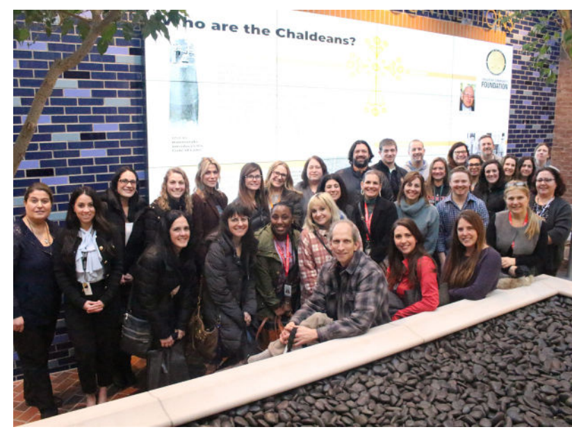
Jeanette Junior High School in Sterling Heights visits CCF for Cultural Awareness Training.

By preserving cultural artifacts, stories, and traditions, societies can nurture creativity and innovation, enriching the cultural landscape for future genera-