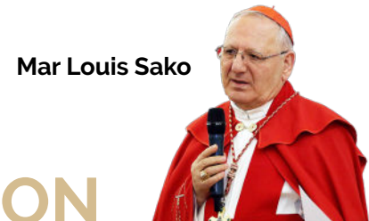
Mar Louis Sako