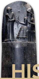
1750 BC Hammurabi introduces his Code of Laws